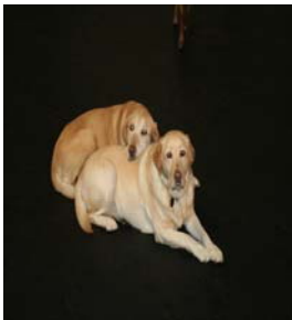
Pooh & Gromit