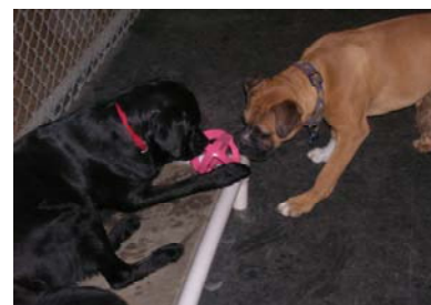
RIO AND TYSON GO HEAD TO HEAD