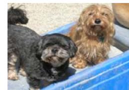
Hootie and Sparky